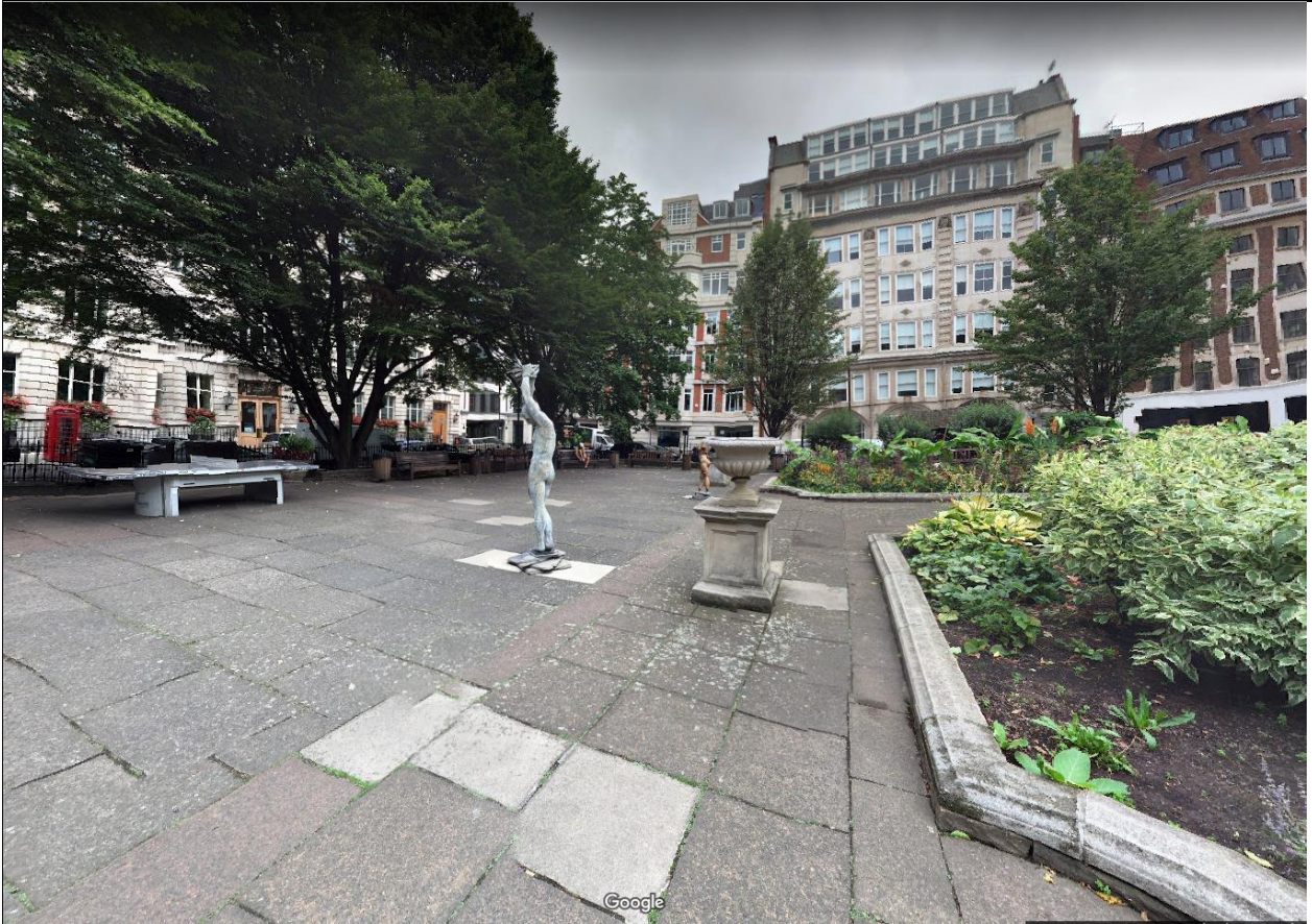
View of south east side of Golden Square